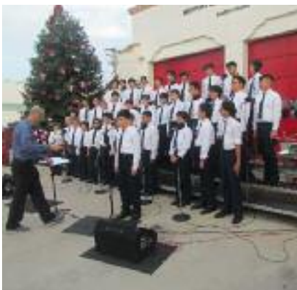
The All-American Boys Chorus