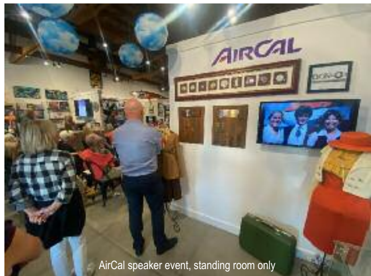
AirCal speaker event, standing room only