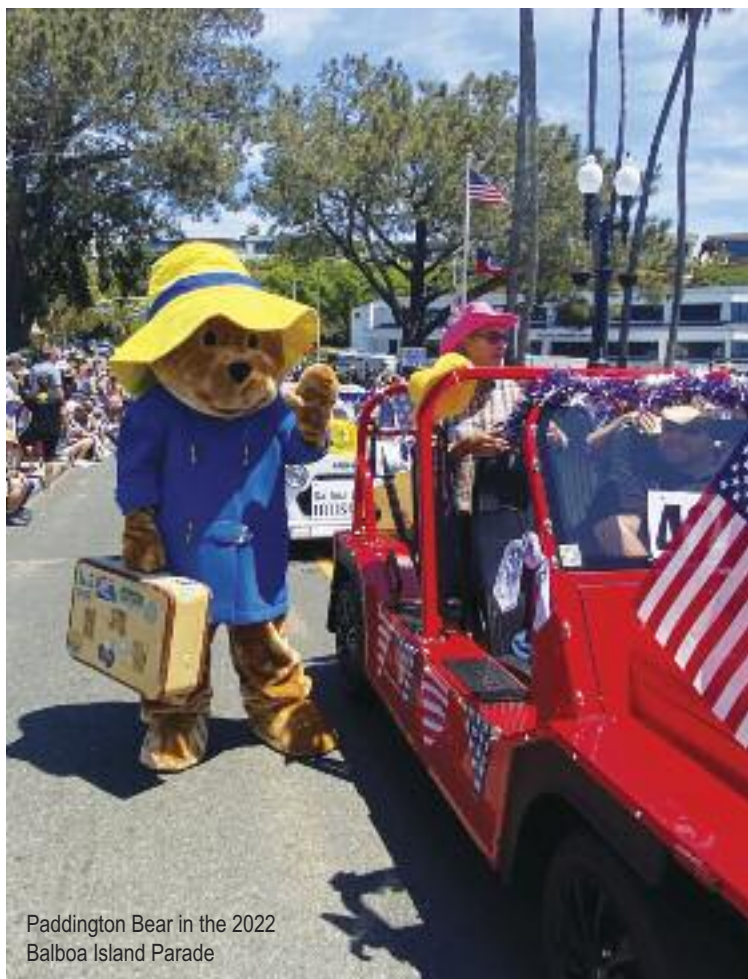
Paddington Bear in the 2022 Balboa Island Parade