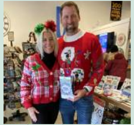
Guests came fantastically festive