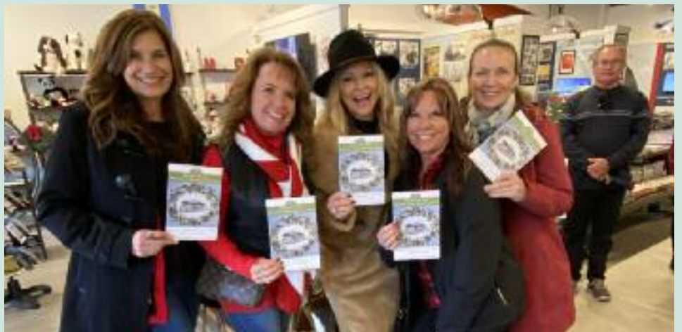
"The Five Buddies" ready to storm the homes