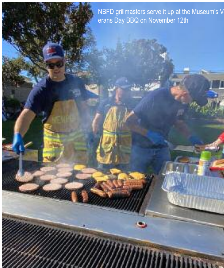
NBFD grillmasters serve it up at the Museum's Veterans Day BBQ on November 12th

• The museum followed up Memorial Day with its Balboa Island Veterans Day BBQ 2022, Bress giving props to the “chefs” from Newport Beach Fire Department. “You all rock and thank you to all who helped and made the event super special for our Vets and Community.”