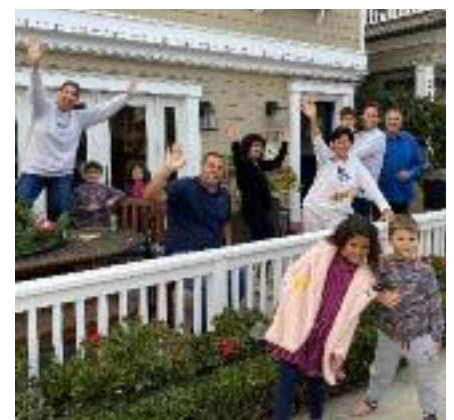
Island families gather to watch the cart parade