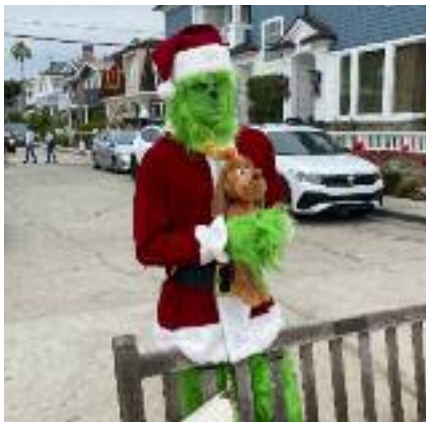
Uninvited Whoville visitor