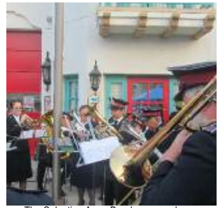
The Salvation Army Band was a welcome special surprise addition to the day