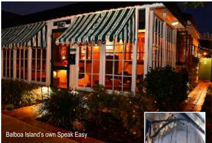
Balboa Island's own Speak Easy

• Museum benefactors stepped up with financial and logistical-