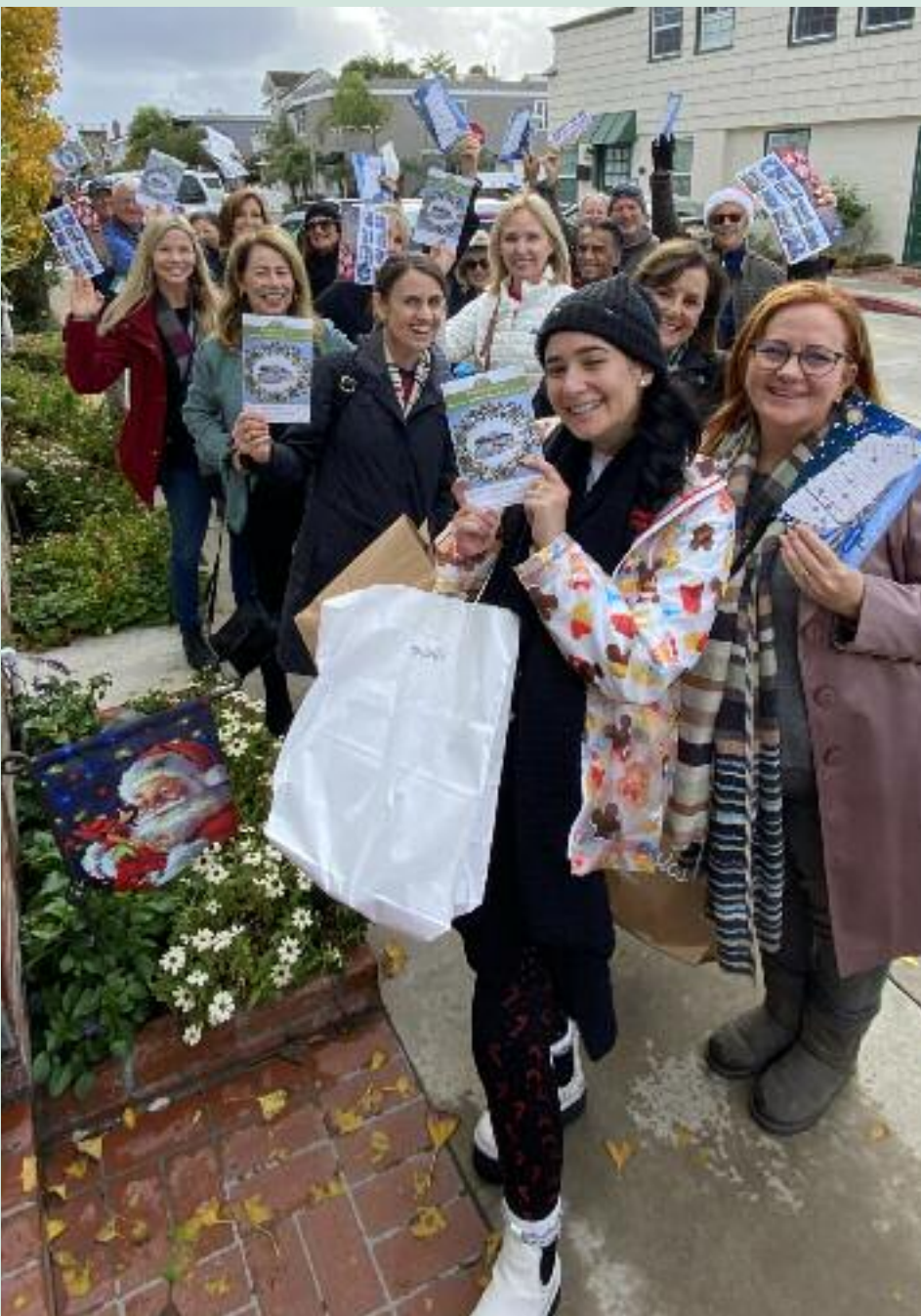
Happy Home Tour ticket holders anticipate another home to visit