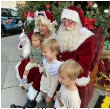
Santa & Mrs. Claus hold court