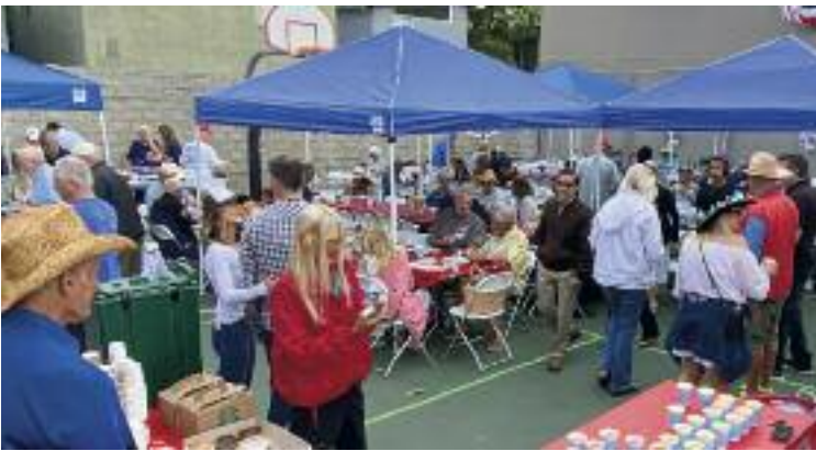
Our annual neighborhood social, the Pancake Breakfast brings Islanders together

The BIIA held it's Annual Pancake Breakfast and Parade Award Ceremony in Balboa Park June 24th. Over 200 attended and enjoyed music, entertainment, fantastic food, and getting together with their neighbors.