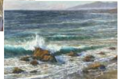
"Here Comes the Sun"