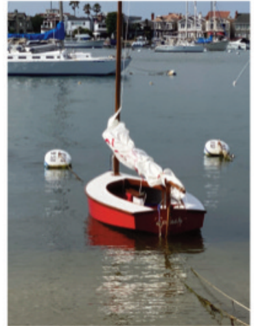
'Splash' ready for a harbor sail