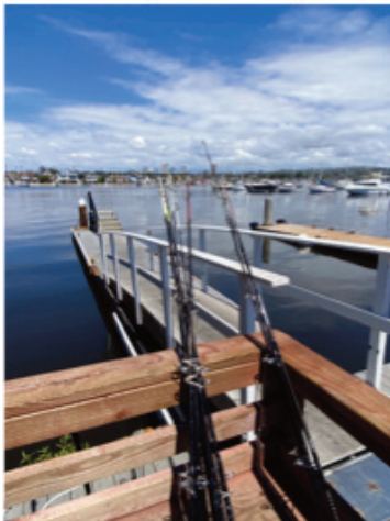
View towards Balboa Island from the landing at the Pavilion