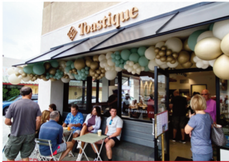
Toastique, a welcome and popular addition to the island