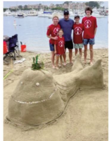
Team O'Brian Family "Whale Castle"

DIAMOND $1,000 Abrams Coastal Properties Clearwater Newport Beach Senior Living