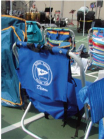
Concerts in the park popularity prompted reserved seating the day before