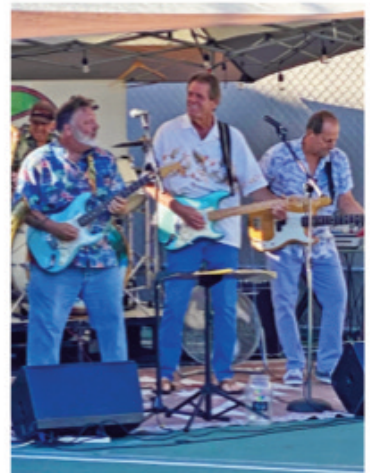
The Fabulous Nomads performed at our Parade and Summer Concert