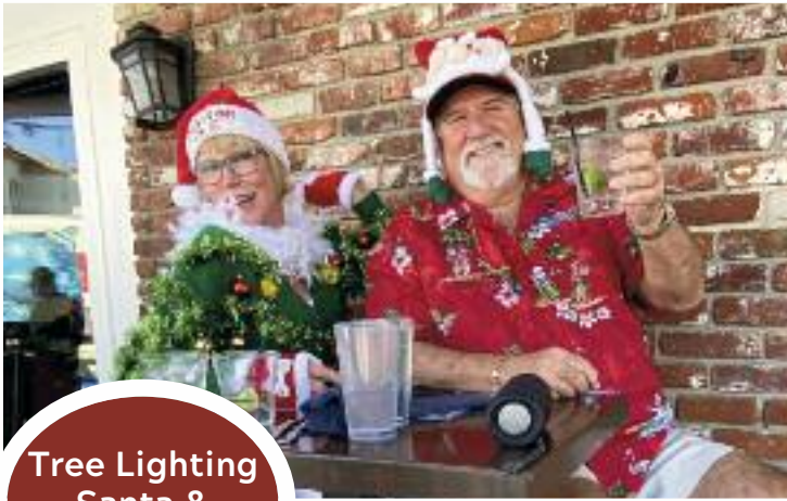
Tree Lighting Santa & Snow Day