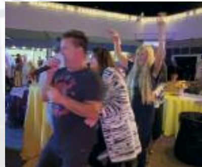
A Conga Line breaks out