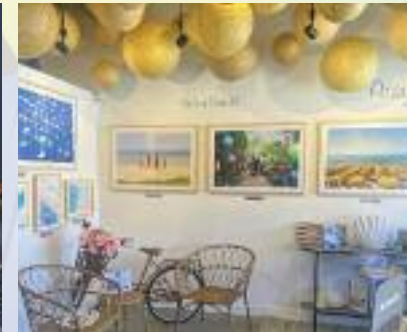
Quarterly Installation Art