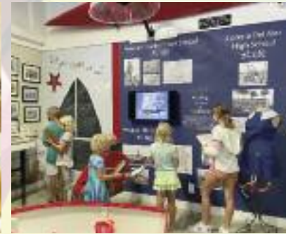
Tours and Scavenger Hunts remain brisk