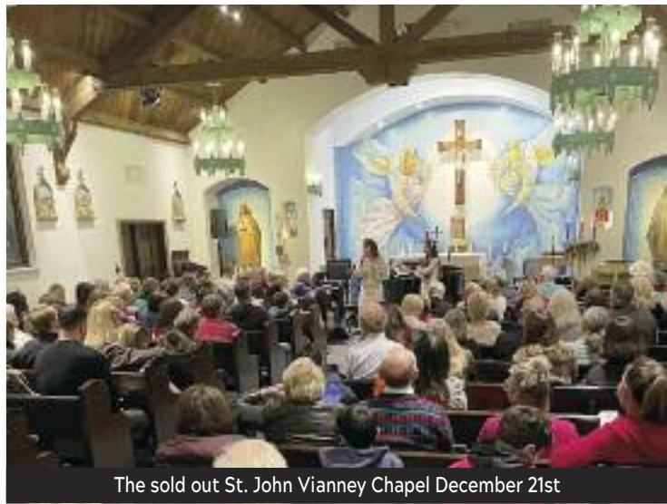
The sold out St. John Vianney Chapel December 21st