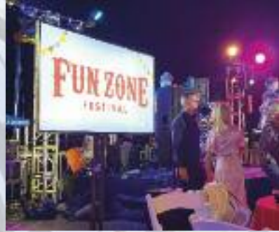
The best event, at the best time