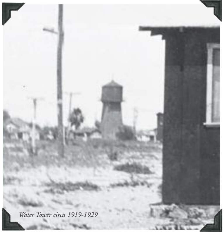
Water Tower circa 1919-1929