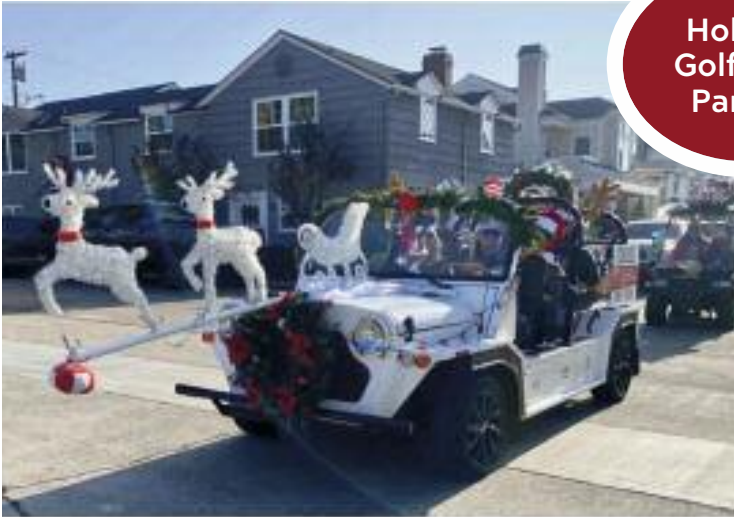
Holiday Golf Cart Parade