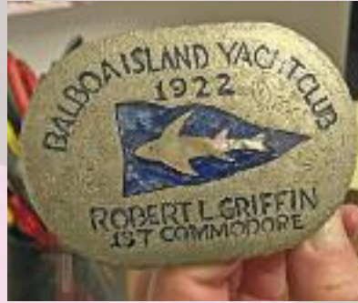
Amazing treasures collected