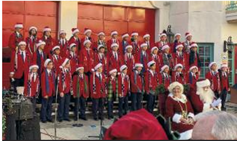
The All American Boy's Chorus perform at the Tree Lighting Ceremony