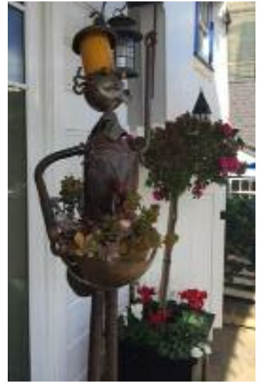
A metal sculpture holding succulents in front of a planter containing an azalea