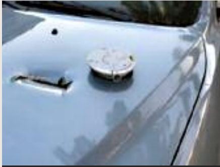
In January, a jet part fell onto this car on Balboa Island while being driven!