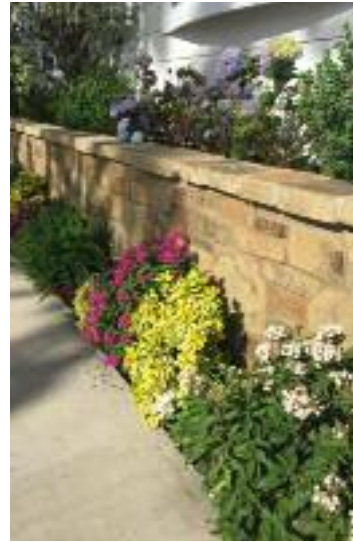
Layers of flowers along the side yard

Artyn takes her love of color to the sewing machine and is quite a prolific quilter. She took some time to show me one of her latest creations: a quilt of the "Hungry, Hungry