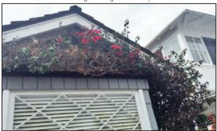
4 • THE ISLAND BRIDGE